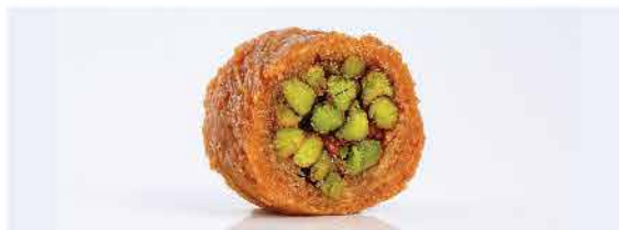
BORMA PISTACHIOS VEGAN

Carton Box or Tin Box, Individually Wrapped