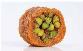
BORMA PISTACHIOS (NO ADDED SUGAR)

Cardboard or Tin Box Individually Wrapped