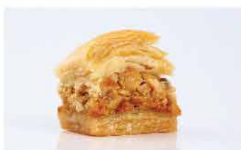
BAKLAVA CASHEW NUTS

Cardboard or Tin Box Individually Wrapped 900 Gr Dry & Cool Place 180 Days