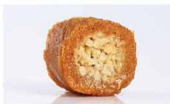
BORMA CASHEW NUTS

Cardboard or Tin Box Individually Wrapped 900 Gr Dry & Cool Place 180 Days