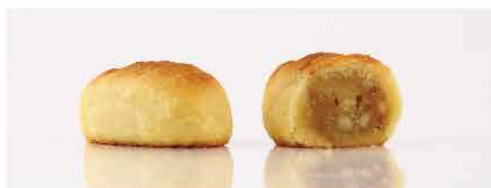
KARBOUJ WALNUTS (FINGERS)

Cardboard or Tin Box, Individually Wrapped 900 Gr Dry & Cool Place 30 Days