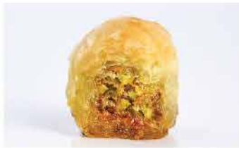
KOL W SHKOR VEGAN

Cardboard or Tin Box Individually Wrapped