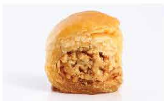
KOL W SHKOR VEGAN

Cardboard or Tin Box Individually Wrapped