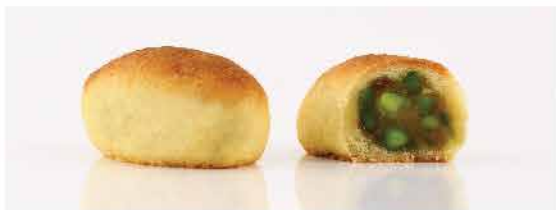
KARBOUJ PISTACHIOS (FINGERS)

Cardboard or Tin Box, Individually Wrapped 900 Gr Dry & Cool Place 30 Days