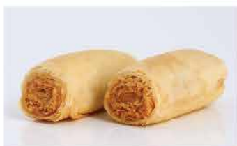
FINGERS CASHEW NUTS

Cardboard or Tin Box Individually Wrapped 900 Gr Dry & Cool Place 180 Days