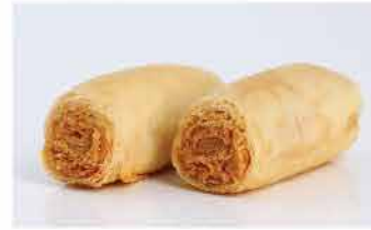
FINGERS CASHEW NUTS VEGAN

Cardboard or Tin Box Individually Wrapped