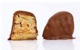
BAKLAVA PEANUT DIPPED IN CHOCOLATE

Cardboard or Tin Box Individually Wrapped 900 Gr Dry & Cool Place 30 Days