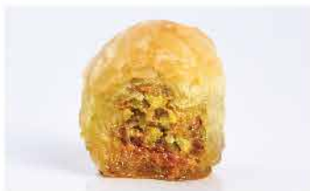
KOL W SHKOR PISTACHIOS

Cardboard or Tin Box Individually Wrapped 900 Gr Dry & Cool Place 180 Days