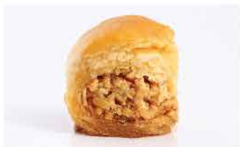
KOL W SHKOR CASHEW NUTS

Cardboard or Tin Box Individually Wrapped 900 Gr Dry & Cool Place 180 Days